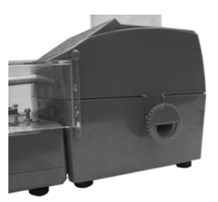
Turn the drain spout ½ turn to open the spout