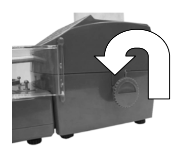
Drain spout on the right hand side of your dispenser