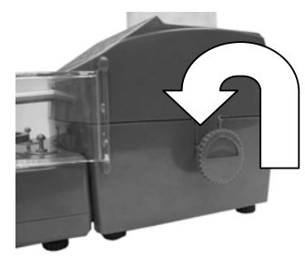
Drain spout on the right hand side of your dispenser