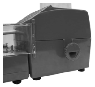
Turn the drain spout \frac{1}{2} turn to open the spout