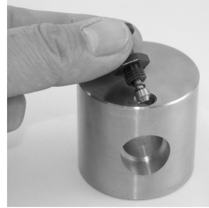
Installing Locking Pin

Install the Locking Pin assembly into the single threaded through hole on the side of the Measuring Cylinder and tighten. Carefully insert the assembly into the main casting, this is a precise fit, do not force the cylinder into the casting. Insert screws through the handle and attach to the measuring cylinder on the opposite side of the Locking Pin. The Powder Measure can be set up for right or left handed use depending on which way you slide in the assembly.